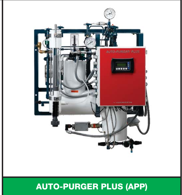
AUTO-PURGER PLUS (APP)

The Hansen AUTO-PURGER PLUS efficiently and automatically helps maintain condensing and suction temperatures at nearly optimum operating conditions. Because both air and water removal functions are incorporated into one compact unit, floor space, maintenance, and energy are minimized. Additionally, the operation of the AUTO-PURGER PLUS is very similar to the Hansen standard AUTO-PURGER so those familiar with the AUTO-PURGER will find it very easy to use and maintain.