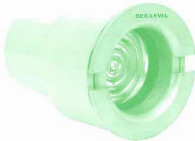
STANDARD SEE-LEVEL™: H1100-R