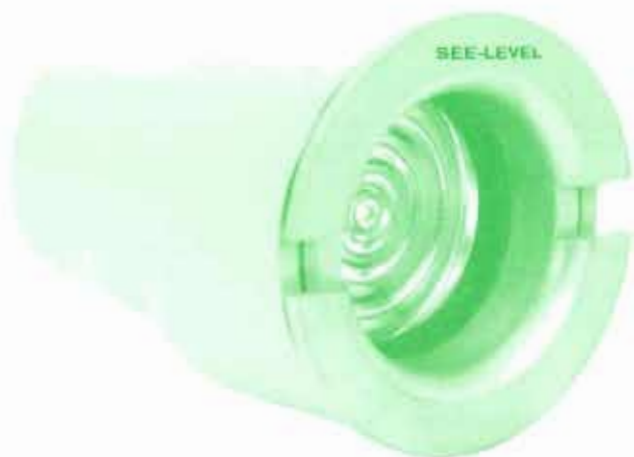
STANDARD SEE-LEVEL®: H1100-R