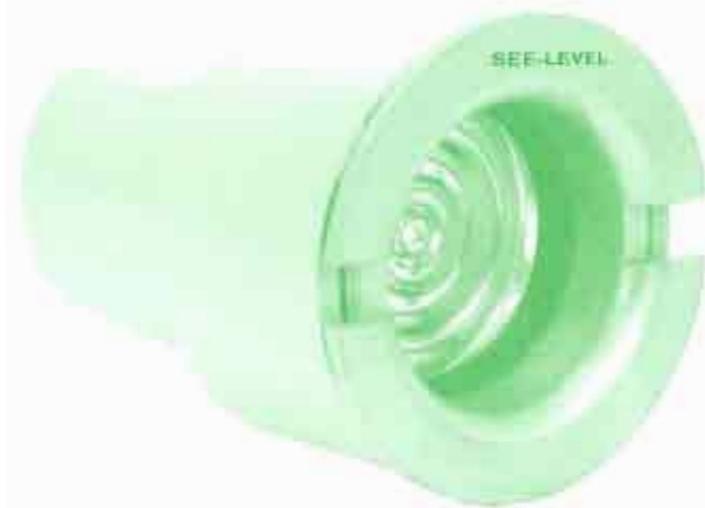
STANDARD SEE-LEVEL™: H1100-R