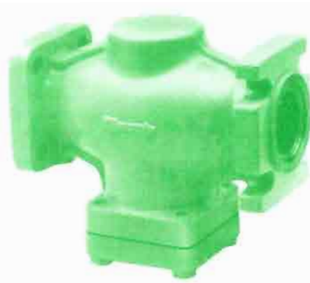
2" Strainer: ST200