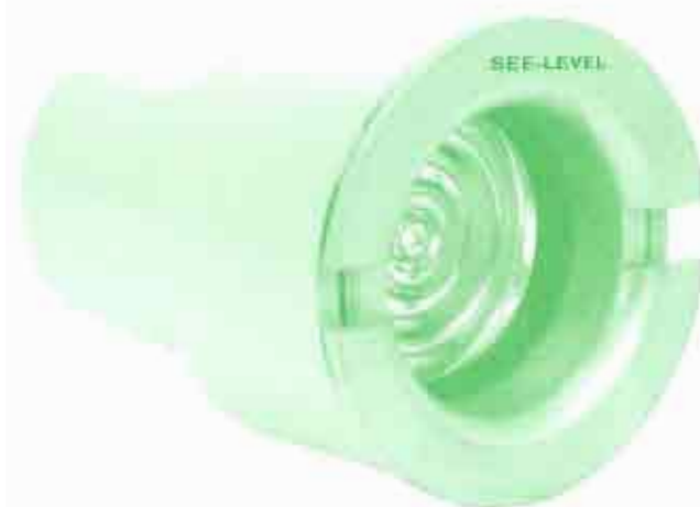
STANDARD SEE-LEVEL™: H1100-R