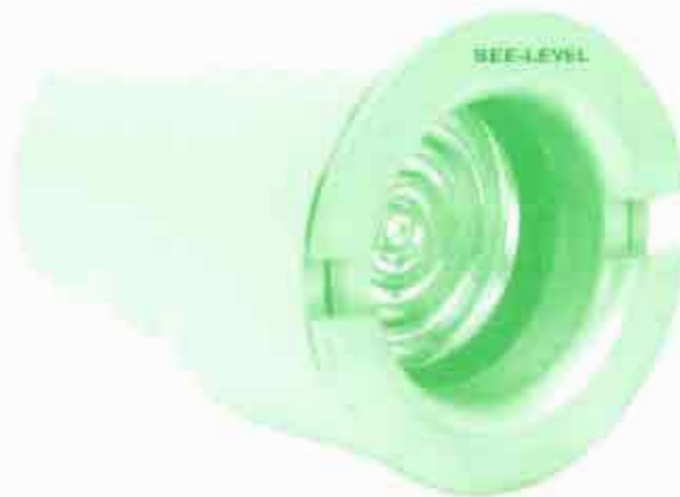
STANDARD SEE-LEVEL®: H1100-R