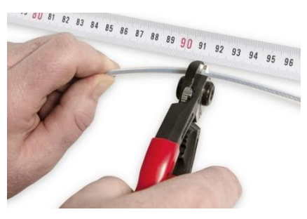
Define the required length of sensor from column. Shorten the wire with wire cutter.