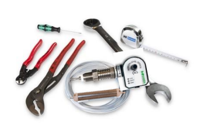
To install the sensor, you must use a 2.5 mm hex key, and a wrench.

The sensor length is determined by column length. Cut the insulated steel wire to the desired measuring length with wire cutters as shown below.